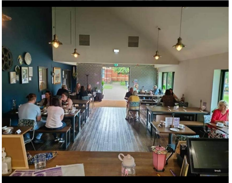
Puds 'n' Guds